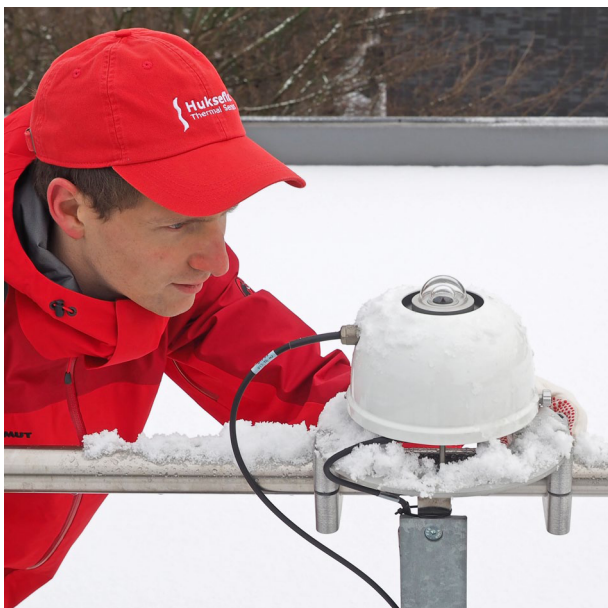
Figure 2 SR22 sensor combined with VU01 ventilation unit