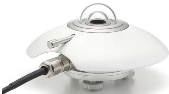
Figure 5 SR22 side view