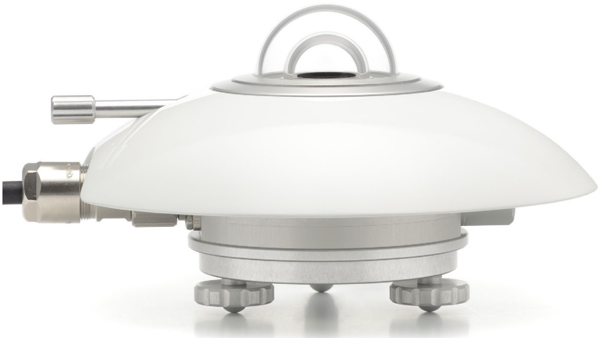
Figure 1 SR22 secondary standard pyranometer

SR22 is a solar radiation sensor of the highest category in the ISO 9060 classification system: secondary standard. On top of the features and benefits of the successful SR20 pyranometer, SR22 has domes made of high-quality quartz, resulting in an extended spectral range. Covering the full solar spectrum, SR22's extended spectral range potentially offers lower measurement- and calibration uncertainties compared to pyranometers with glass domes. SR22 is typically used in combination with VU01 ventilation unit in high-accuracy climatological networks.