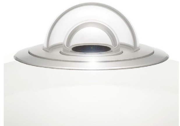
Figure 4 the inner and outer quartz domes of SR22 allow users to utilise SR22's extended spectral range

Applicable instrument classification standards are ISO 9060 and WMO-No. 8. Included in delivery as required by ISO 9060: test certificates for temperature response and directional response. Calibration is according to ISO 9847. PV related standards are ASTM E2848 and IEC 61724.